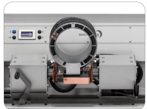
90° Coil Rotation for maximum flexibility